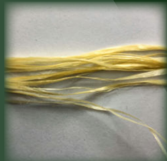
Old Technology Twine

Pro-Twine products are manufactured using full state of the art computerised extrusion technology. We ensure high knot efficiency by using automated robotic twisting systems, guaranteeing top performance and an extremely high level of quality control.